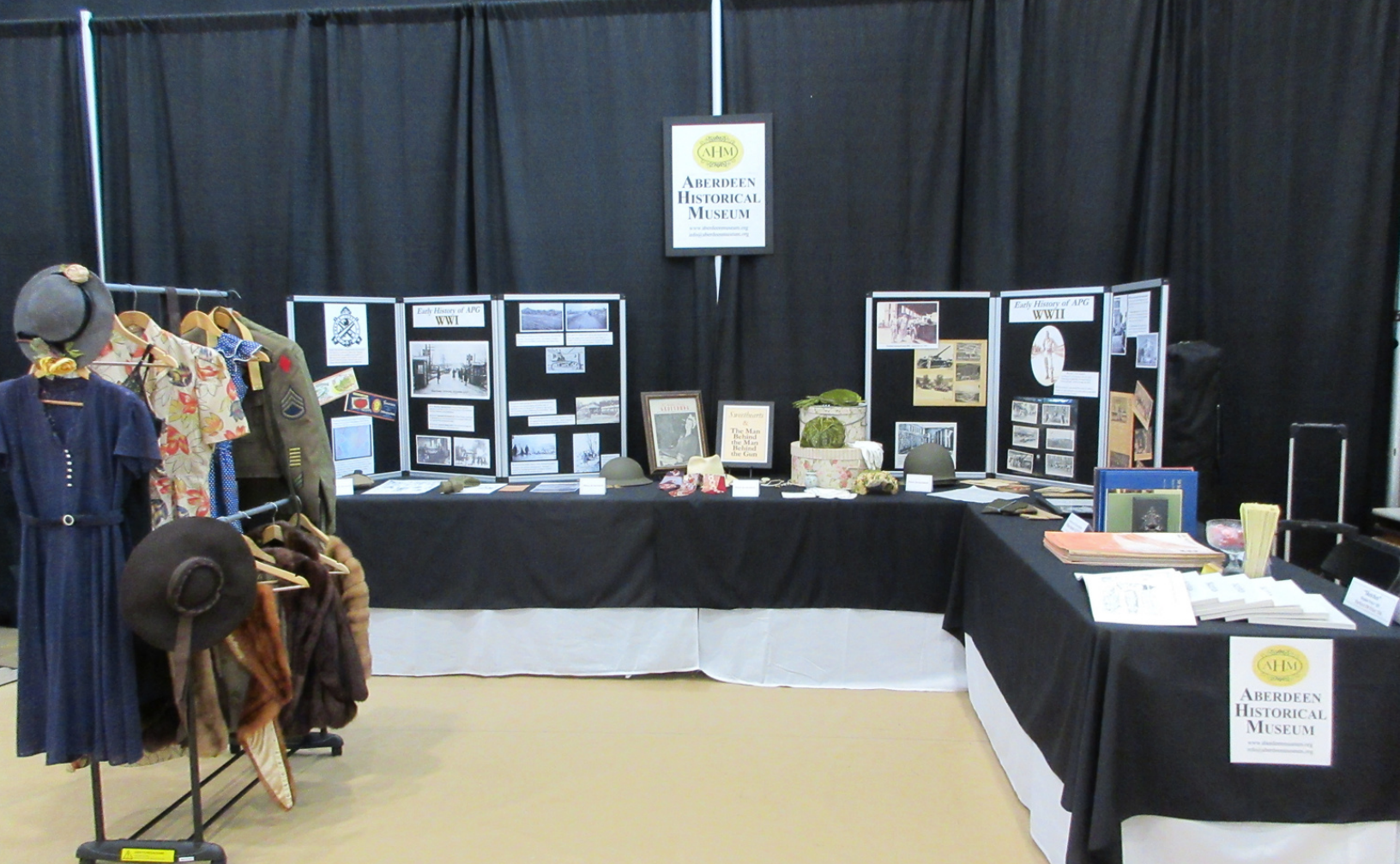
Aberdeen Museum's entire display booth at the Harford 250 HCC event; includes early history of APG during WWI & WWII and civilian clothing during the WWII era