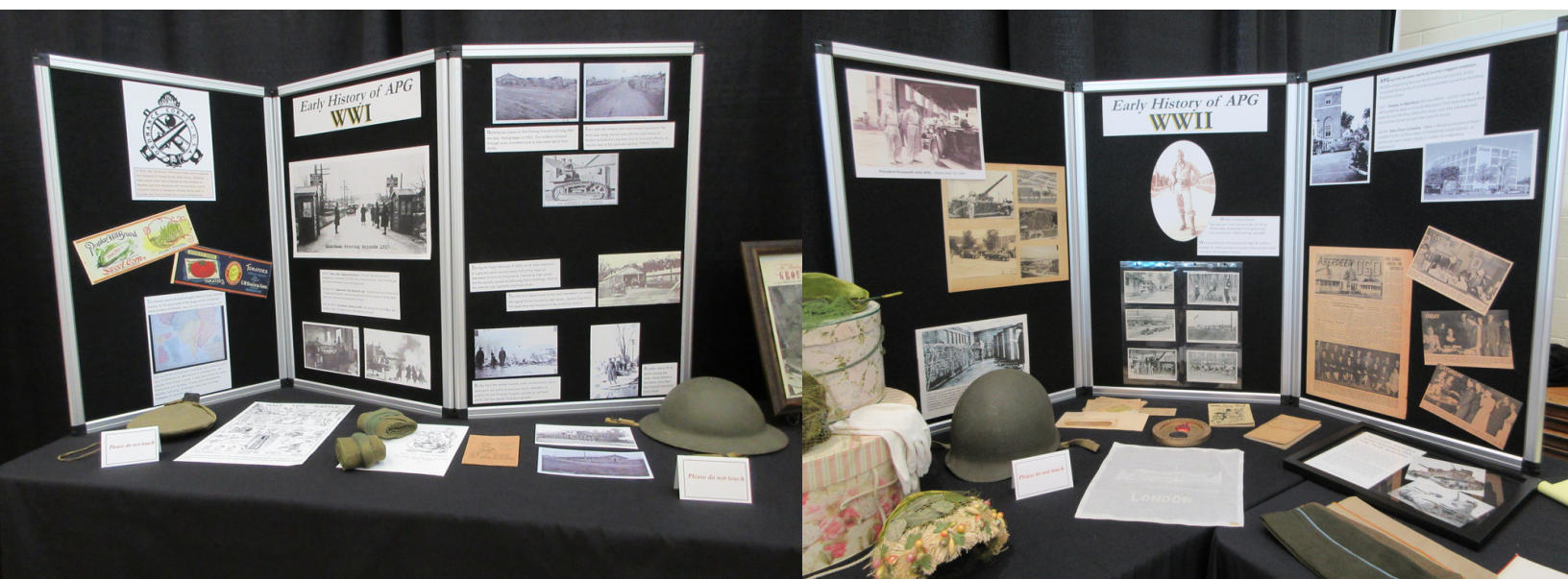
WWI and WWII display boards and artifacts